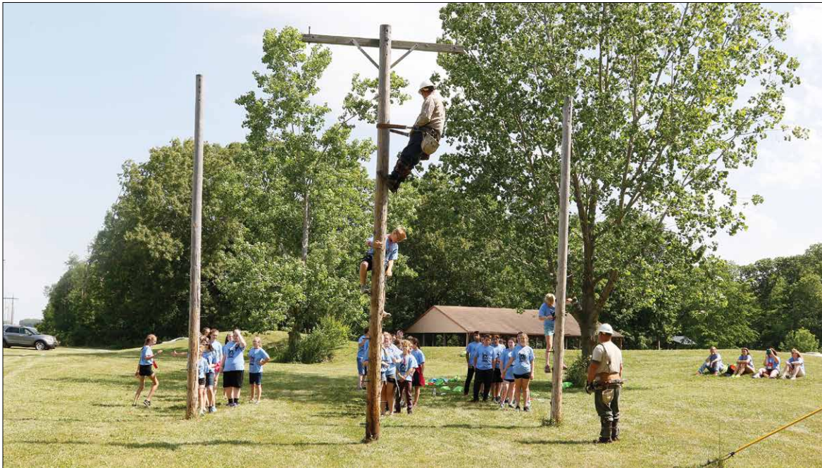
On page 7, read about Touchstone Energy Camp and how your student can apply